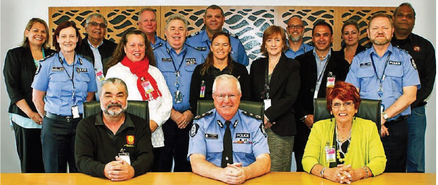
The APAF meets with Chris Dawson, the Commissioner of Police.

Building on his apology to Aboriginal and Torres Strait Islander people in July, WA Police Commissioner Chris Dawson has announced the creation of a new Aboriginal Affairs Division. The division's primary role is to build, foster and sustain better relationships with Aboriginal people in each region. To complement the work of the AAD, the Commissioner has also established the Aboriginal Police Advisory Forum, which aggregates the experience and leadership of the police executive and eight Aboriginal leaders from across WA. The APAF will meet quarterly to provide high-level policy advice and information on historical and environmental factors affecting WA Police's relationship with and service delivery to Aboriginal people. The inaugural members of the APAF are: