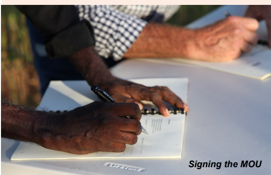
Signing the MOU

MG and NPM are exploring the possibility of establishing a cattle hub on MG land, including centre-pivot irrigation, a licensed weighbridge, a feedlot, drafting facilities and quarantine yards. The parties will now work together to assess the suitability of land for the proposed hub in consultation with relevant MG people.