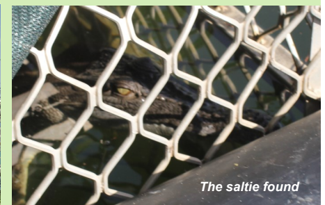
The saltie found