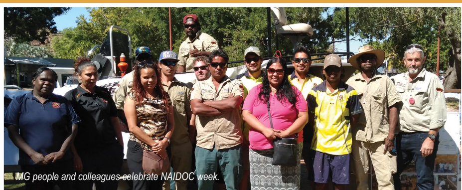
MG people and colleagues celebrate NAIDOC week.