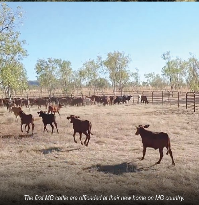
The first MG cattle are offloaded at their new home on MG country.

The completed property will form the new Yardungarrl Station.