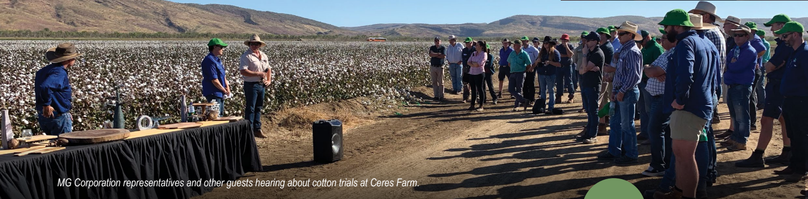
MG Corporation representatives and other guests hearing about cotton trials at Ceres Farm.