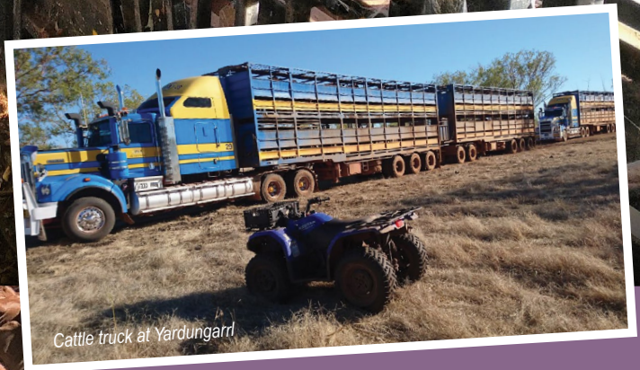
Cattle truck at Yardungarrl

History was made this month, when the newly formed MG Cattle Company (MGCC) welcomed its first herd to MG land.