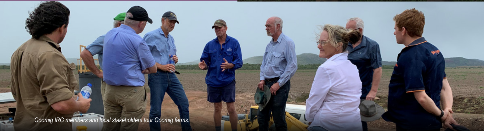
Goomig IRG members and local stakeholders tour Goomig farms.