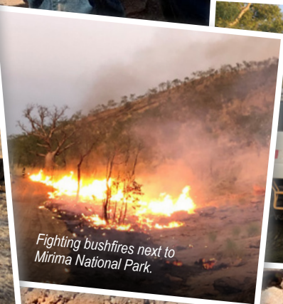
Fighting bushfires next to Mirima National Park.