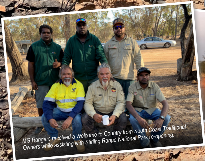
MG Rangers received a Welcome to Country from South Coast Traditional Owners while assisting with Stirling Range National Park re-opening.