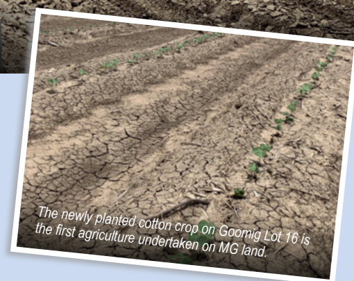
The newly planted cotton crop on Goomig Lot 16 is the first agriculture undertaken on MG land.