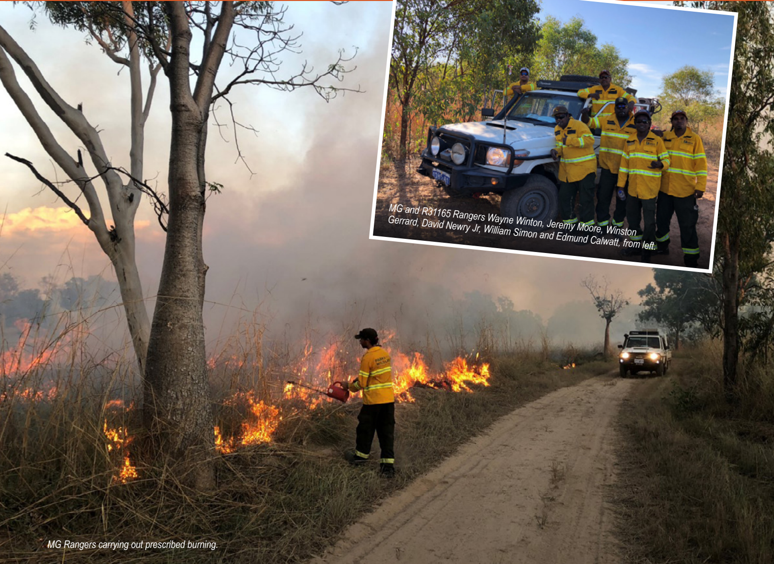
MG Rangers carrying out prescribed burning.