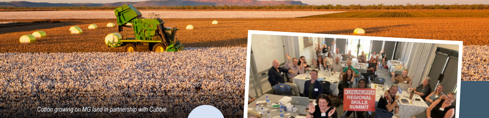
Cotton growing on MG land in partnership with Cubbie.

MG Corporation has welcomed the approval of a $32 million loan to establish a cotton processing facility in Kununurra.