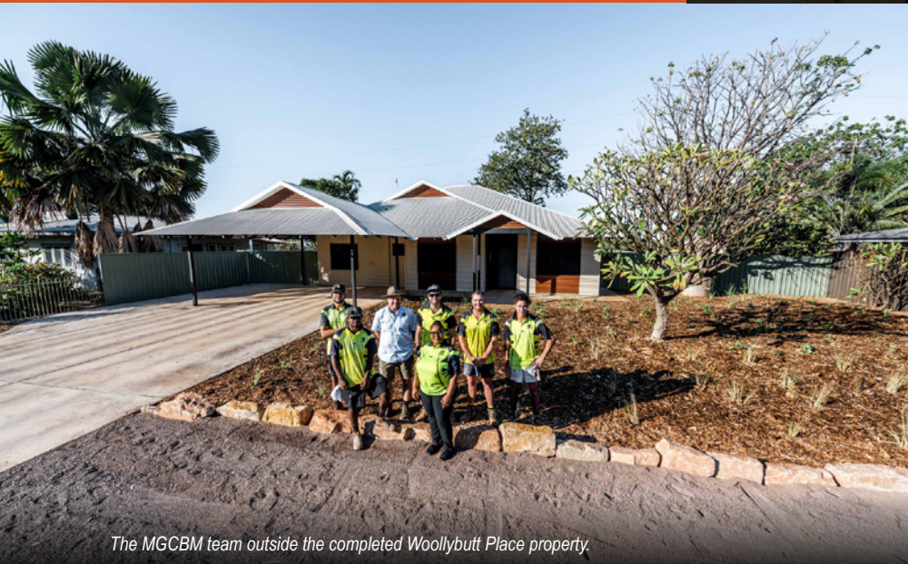
The MGCBM team outside the completed Woollybutt Place property.