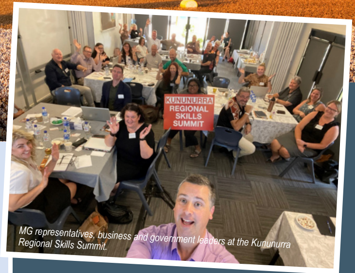
MG representatives, business and government leaders at the Kununurra Regional Skills Summit.

The State Government previously granted KCC $4 million in funding to upgrade electricity supply infrastructure to support a cotton gin.